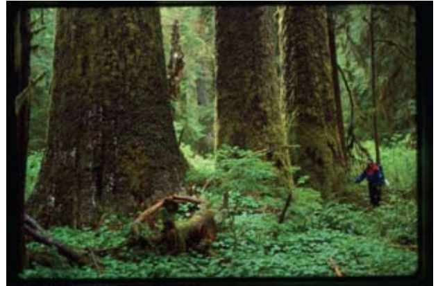
The CORE process resulted in hundreds of thousands of new protected areas including an expanded Carmanah-Walbran Provincial Park

As well as funding individual sectors and groups in each of the CORE regions, the EDRF funded workshops to help the conservation sectors negotiate more effectively. One tri-table workshop brought together conservation representatives from all three regions to share information and develop strategies to participate more effectively. This coordination helped ensure that the tables were not working at cross purposes. “Everything we did had an impact on the other tables,” recalled Kate Brauer, negotiator for the Conservation Sector at the Vancouver Island table – the first of the tables to get underway. “We needed to coordinate with the