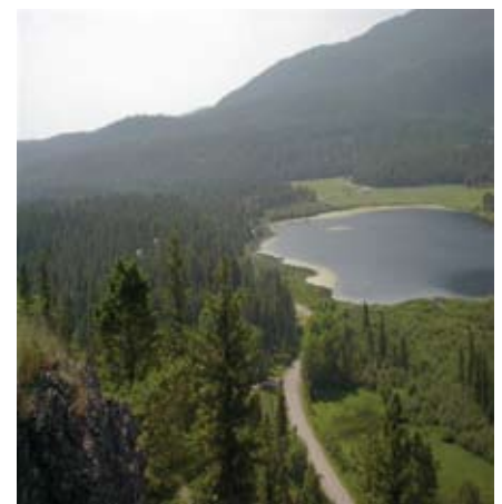
Valley view of the Ha Ha

1990-1991 – Oil spill compensation – Volunteers who cleaned up oil after the Nestucca oil barge spill and rescued animals in distress on the West Coast of Vancouver Island reached a settlement in a lawsuit to recover their expenses.