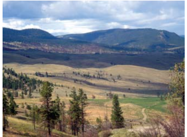
The ranch site, near Ashcroft, BC.

On January 22, 2008, in a surprise reversal, the MetroVancouver Board