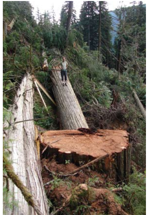
A clear cut on the Sunshine Coast

2004-2006 – Holding foresters accountable – The Sunshine Coast Conservation Association successfully sued the Association of BC Forest Professionals – not once but twice – to force the