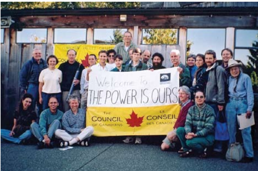
An energy conference organized by the GSXCCC and the Council of Canadians helped to identify strategies to oppose the Georgia Strait pipeline.

Today, there are no gas-fired power generation plants on Vancouver Island. Instead, the Island receives the majority of its power from three hydro generating stations on the Campbell River system, and diversion dams on Quinsam River, Salmon River and Heber Creek.