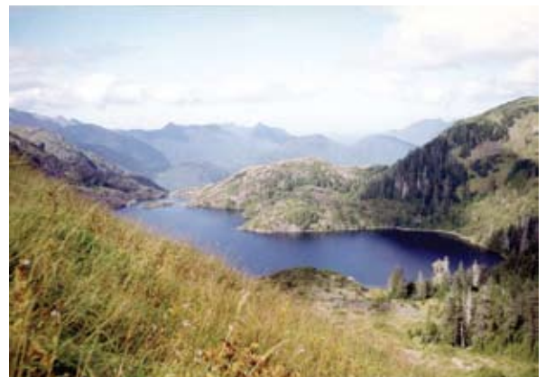
Takakia Lake on Haida Gwaii

1995-1996 – BC Energy Coalition – The EDRF provided several grants to the BC Energy Coalition to press for a sustainable BC energy policy at hearings of the BC Utilities Commission.