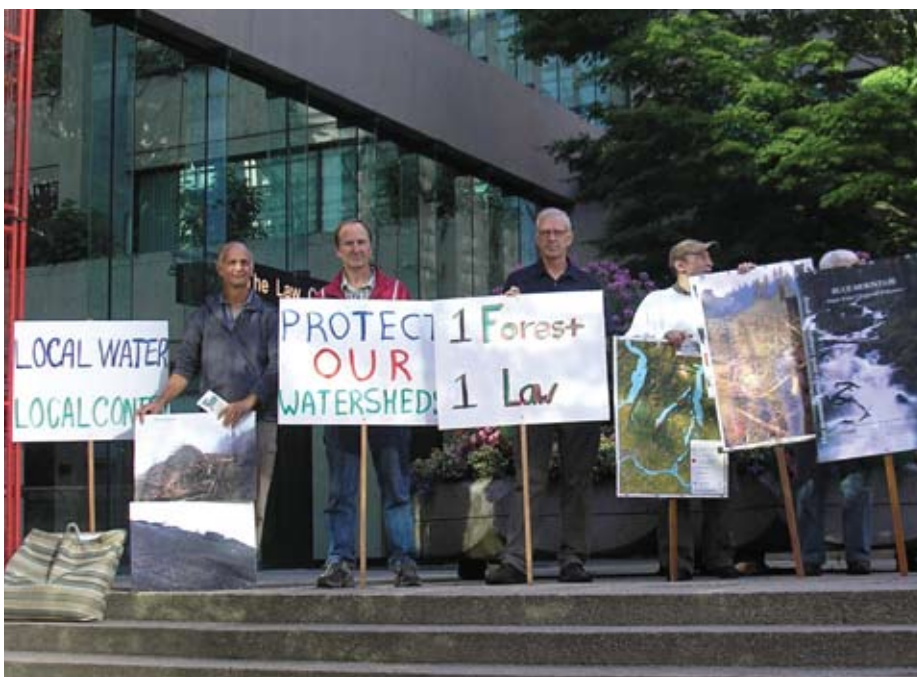
Representatives from various communities rally for clean water on the steps of the Vancouver court house.

1990-1991 – Caves protected from logging – The Outdoor Recreation Council of BC successfully negotiated with the Ministry of Forests to establish legal protection for caves and other geologically significant karst features on Vancouver Island.