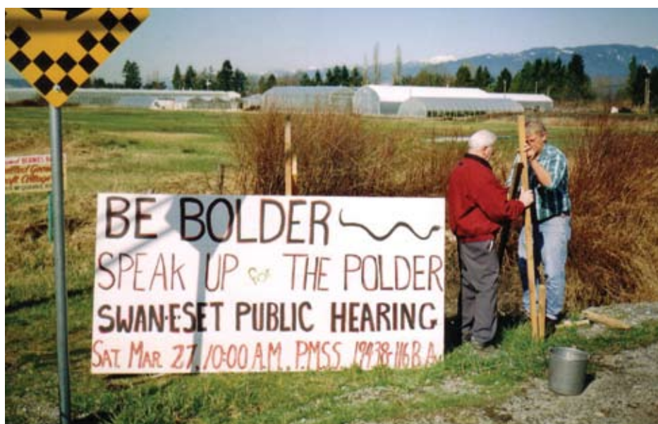
At left, members of the Pitt Polder Preservation Society erect a sign inviting the public to the Polder Swan-E-Set public hearing, 1999

As a result of the Society's efforts, 126 acres of important bird habitat and agricultural land was not rezoned to allow residential and resort development. The hard work of impassioned citizens and the support of the EDRF means the land remains a peaceful and beautiful agricultural area today, helping to support the diverse ecosystems and uses of the Pitt Polder.