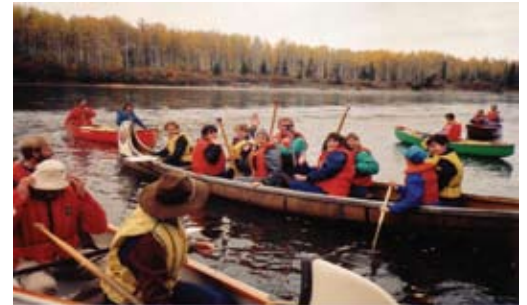
Rivers Defence Coalition field trip on the Nechako River

Following their defeat in court, the Coalition persuaded the BC government to conduct a provincial inquiry through the BC Utilities Commission (BCUC), with the Rivers Defence Coalition as a lead participant after Alcan. In December 1994, the BCUC reported the KCP would seriously impact the health of salmon fisheries, resulting in the province’s decision, in January 1995, to reject the